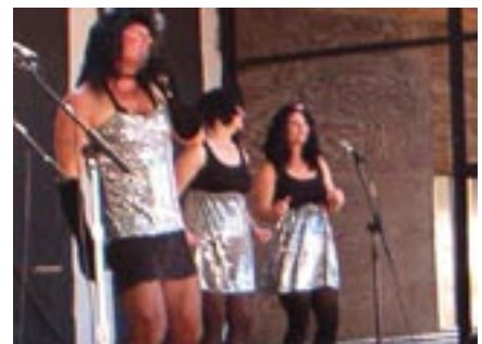
Carlisle's Finest at Homecoming 2003

Now is the time to be thinking of the leadership of your organization. Please share your thoughts with members of the board of directors before the January meeting.