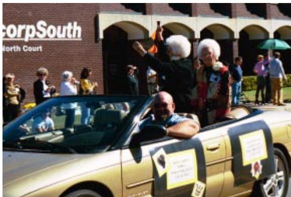
Two former queens in the 2004 parade

During our 2005 homecoming celebration, we will begin accepting donations toward these goals. Our initial goal toward this fundraising effort will be $10,000. This will allow us to acquire the very basic necessities to begin preserving our collection. All contributions to the alumni association for historical efforts are 100% deductible on federal tax forms. Your checks can be made out to the Carlisle Alumni Association. Help us preserve the history of your town and your school.