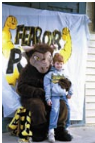
A future alumnus at Homecoming 2004