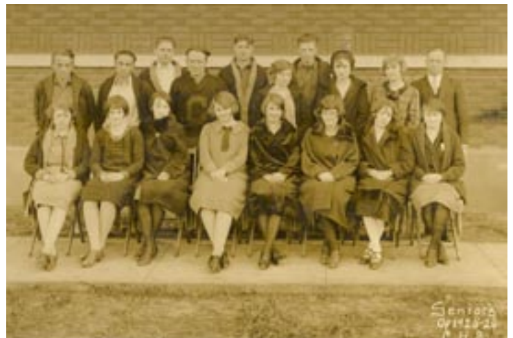
Carlisle High School Class of 1926

Approximately $1,200.00 has been contributed at this time. As funds continue to become available and the association is successful in obtaining additional grants, we will move forward with plans to continue restoration of items in the collection and build a history of Carlisle that will last for many generations to come.