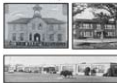
Carlisle High School Alumni Association Carlisle, Arkansas

It was announced in our Spring newsletter that the Alumni Association was publishing