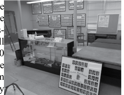
Work continues to prepare the museum for homecoming weekend

The Alumni Association is very pleased to present the Museum of Carlisle History to our alumni, schools, and citizens of Carlisle. The museum has been an ongoing project of the alumni association since 2000. The school district has been very gracious to allow the use of the former high school cafeteria/superintendent's office to house the extensive collection. The museum will be open from 9:00 a.m. - 9:00 p.m. on Thursday, from 8:30 a.m. until after the football game on Friday, and from 8:00 a.m. - 12:00 p.m. on Saturday (we are hoping to provide shuttle service from the park to the museum on Saturday morning). Be sure to stop by and visit the museum while you're in town for homecoming.