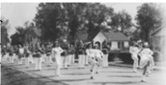
Homecoming parade from the 1940's

The homecoming parade will immediately follow the afternoon coronation ceremony ( check the local newspaper for times ). The parade will line up in the same location in front of the elementary school. Many alumni are planning to participate in the parade. If you or your class are interested